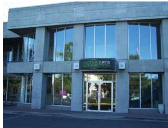
Logo Image by Dan Sali, entitled "The Courtship of Venus" watercolour on paper

VAC offers exceptional facilities for the Pacific Festival of the Book. Located on 2 floors, with over 11,000 sq' the festival will encompass most of the usable space at the facility. The large auditoriums on the 2nd floor will host the exhibitors while workshops and activities are happening in the lower level studios and lobby areas. Front and back load in for set up, elevator access and washrooms on both levels.