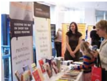
Island Blue Printorium Bookworks booth at PFB 2007

The Pacific Festival of the Book is a dynamic and engaging event that attracts a broad range of interested visitors from all ages and cultural backgrounds. Visitors will enjoy workshops and readings, listen to Open Mic presentations and readings and buy books and merchandise in the Exhibitor's Hall.